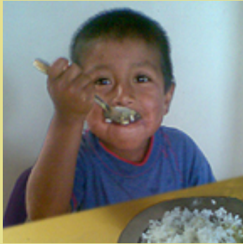
Boy in feeding program Popayan, Colombia