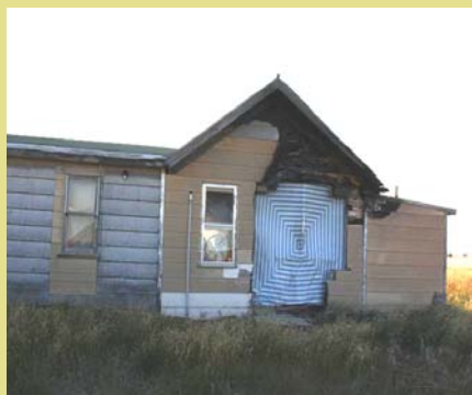
Indian Reservation Fire damaged home – still occupied!