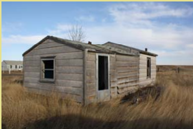
Bear Creek: Needs to be replaced!