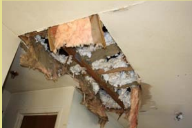
Interior damage of another occupied home. Roof leaks.