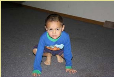
One of the children helped