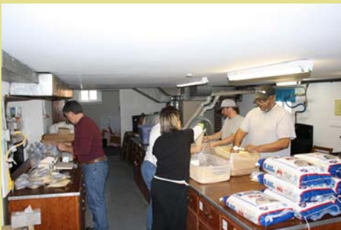
Meals from Kids Against Hunger; assembled by friends at Emmanuel United Church of Christ