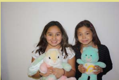
Two grateful children