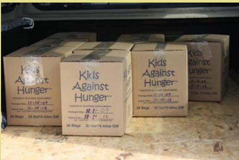
Finished packaging. Loading for trip to reservation