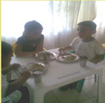
Feeding children in Popayan, Colombia