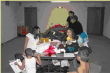
Coats, blankets, clothes, food, books for those in need!