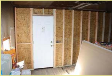
More repair done. Safe from harsh winter!