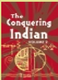
Book of Indian testimonies.