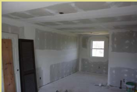
Ready for paint.