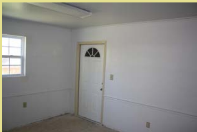
Door in, walls painted.