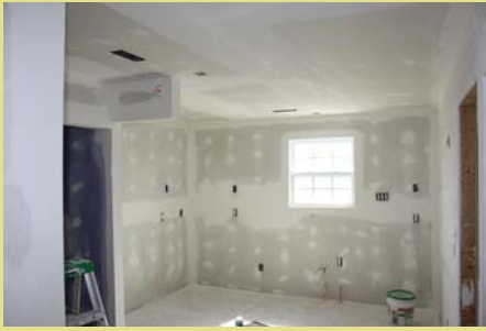
Oasis: another building ready for paint.