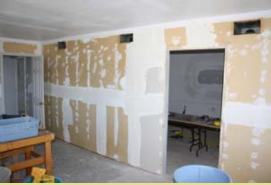
Wall repairs, new door opening.