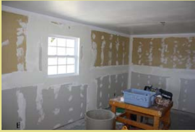
Oasis Food Pantry Interior renovations.