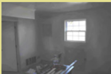
Oasis: old window removed from left corner of wall and new one centered.