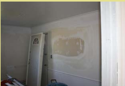
Another window removed.