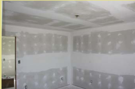
Ready for paint.