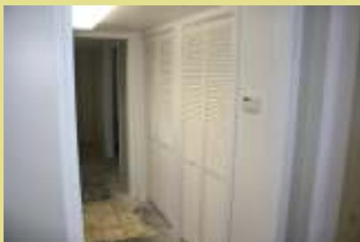
New doors at Oasis.