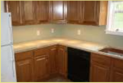
Oasis: counter tile.