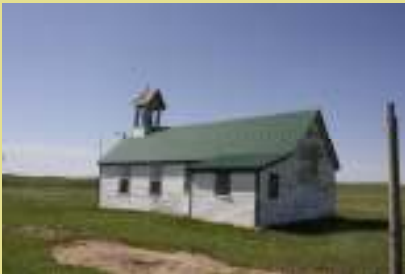
Exterior very weathered.