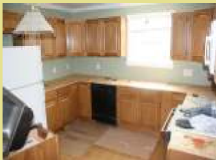
Oasis: kitchen cabinets, counter ready for tile.