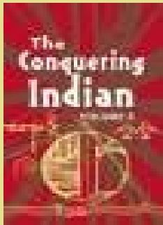
Book of Indian testimonies.