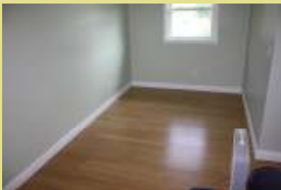
Oasis – new trim.