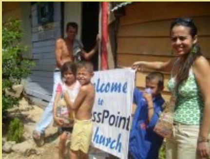
Children being fed in Girardot, Colombia – 2008 Same plan this year.