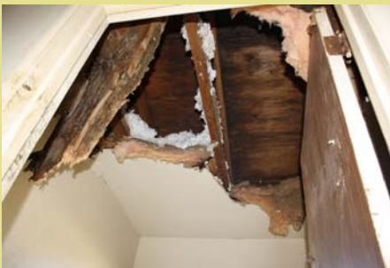
More needed repairs.