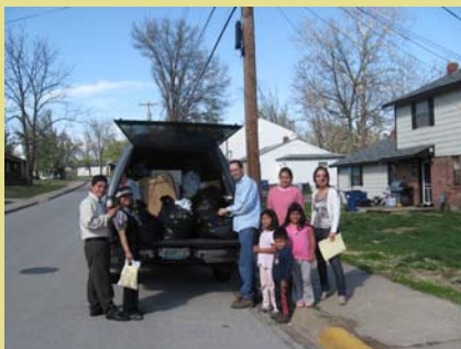
Amigos en Cristo. Clothing distribution