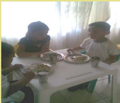
Feeding children in Popayan, Colombia