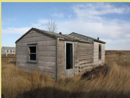
Bear Creek: Needs to be replaced!