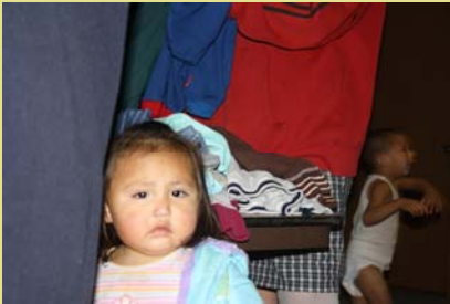
Shy little girl clings to her mother.