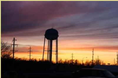
More of God's beauty!