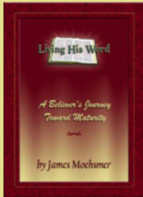
Walking with God