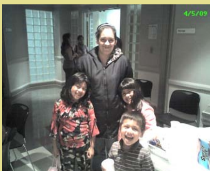
Amigos en Cristo. One of the families that continues to be impacted for Christ!