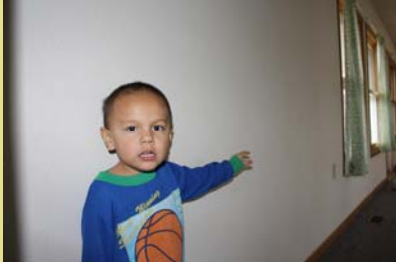
Another helped with clothing.