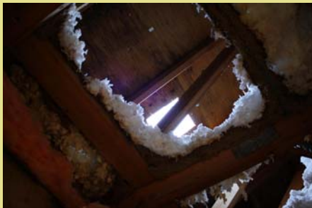
Reservation: inside of home looking out. Pin holes of daylight from missing shingles and large hole from a missing roof vent.