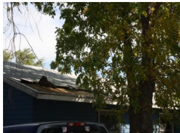
Roof - before