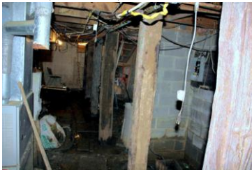
RR tie supports