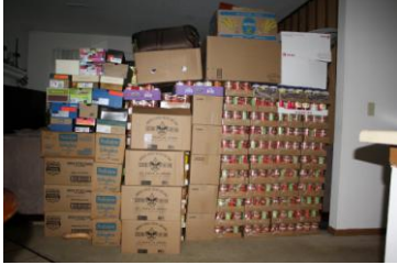
Food, Bibles, books