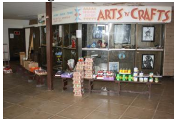
Food, personal care, books