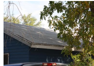
Roof - after

Do not merely listen to the word, and so deceive yourselves. Do what it says.