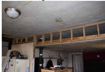
Framing to enclose attic