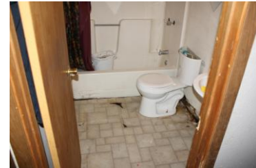
Bathroom - before