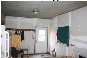
Drywall/electrical going in