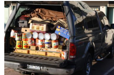
Food, blankets, coats, books