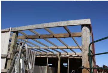
Roof being installed