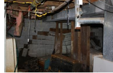
Collapsed block wall