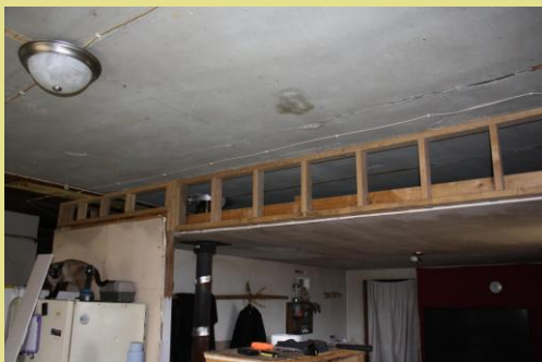
Indian Reservation: Framing to enclose attic