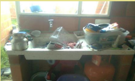
La Victoria - kitchen