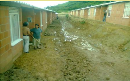
La Victoria – Girardot, Colombia (new community from flooding)