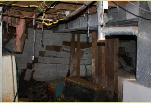
Collapsed block wall