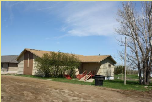
Future Church location for New Life Church "Prayerfully"