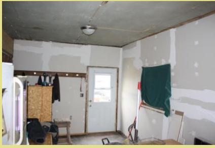
Indian Reservation: Drywall going up