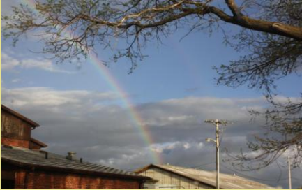
Rainbow over Reservation