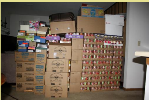
Some of the food taken to the Indian Reservation