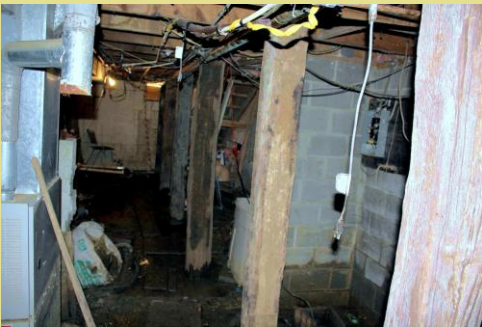
More RR tie supports