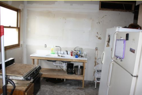
Sink and base installed