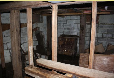
Supports in place