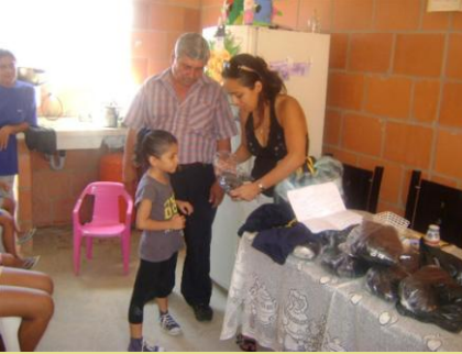
La Victoria – Girardot, Colombia