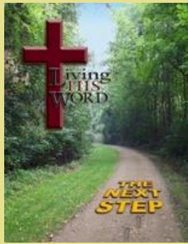
Living His Word The Next Step