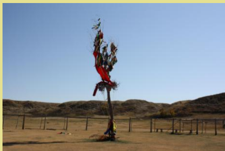
Indian Reservation Prayer tree filled with prayer ties, covered in the blood of Jesus –flowing red sash