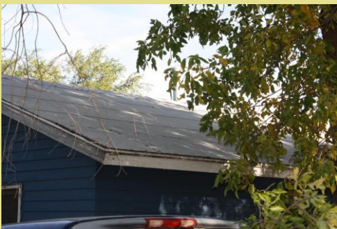
Indian Reservation - roof repaired