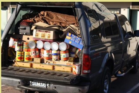
Food, blankets, clothing, and books taken to the Indian Reservation (no more room – need bigger truck)