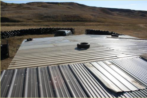
New roof at horse shelter