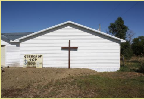
One of two new Crosses