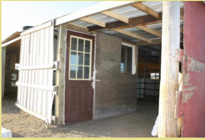
Indian Reservation: -new store room