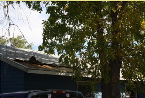
Roof needing repair