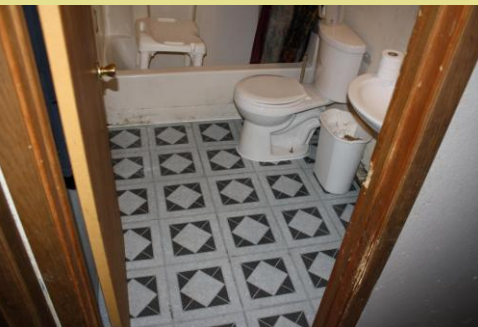
Floor, toilet, sink, tub faucet repaired