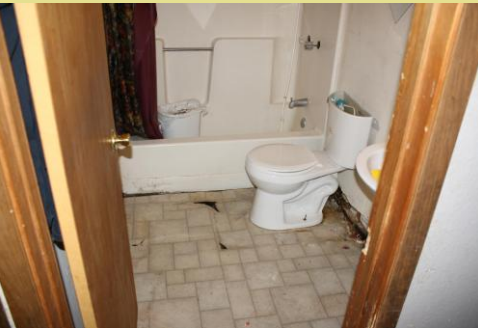
Bathroom before – everything leaks