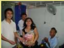
Colombia - food