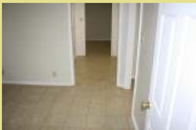
Oasis Tile Four rooms