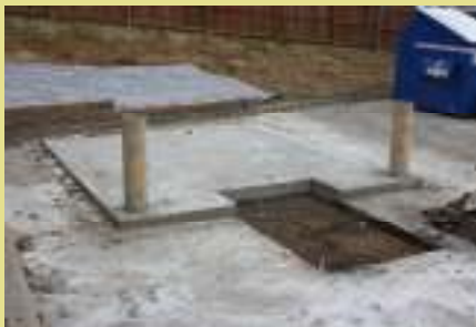
Slab finished, forms removed, ready for freezer and ramp.