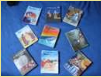
Colombia outreach; Bible stories/activities