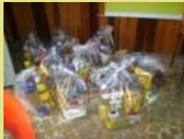
Colombia - food