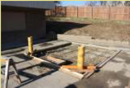
Oasis concrete slab forms