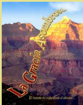
Amazing Grace - Spanish