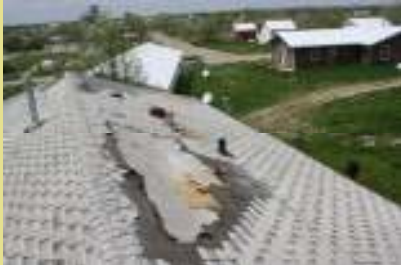
Roof badly damaged with holes and rot.