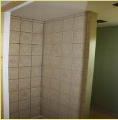
Oasis: shower tile.