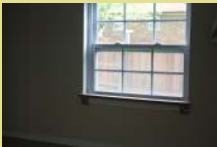
Oasis: window sill and trim. 8 others had full window wrap.