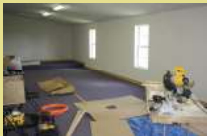
Trim installed at church.