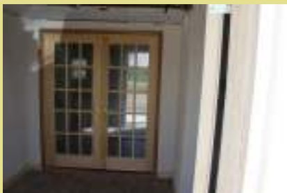
New doors at church.