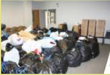
For reservation: clothing, blankets, coats, food, Bibles, and books.