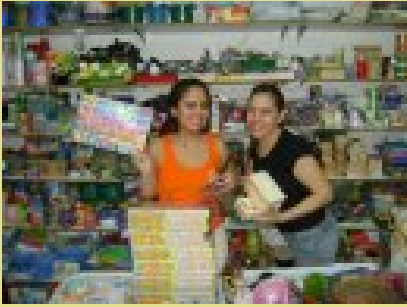
Purchase of food Girardot, Colombia – 2009