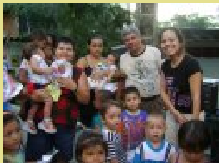
Many thankful families