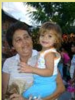
The children make it all worthwhile.