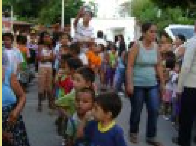
Children waiting for food and presents Chia