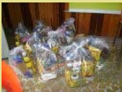
Prepared food packages.