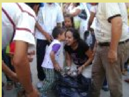
Kisses and smiles from one of many thankful children.