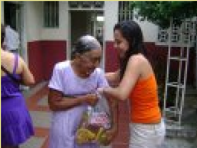
Food distribution in Flandes